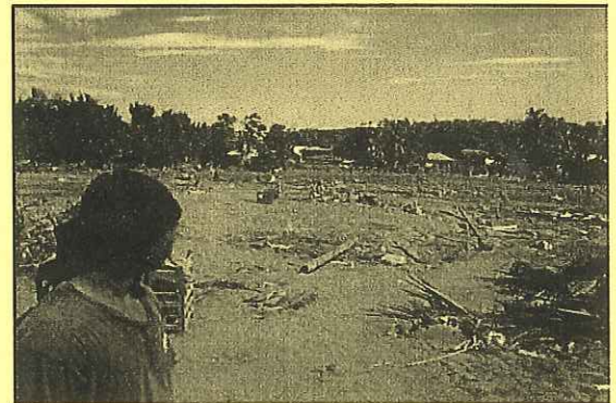
Some 400 families were living in shanty houses made of plywood on this land near Cagayan de Oro. The houses were completely washed away by floodwaters.

Joe Curry, Catholic Relief Services' country representative for the Philippines, arrived at the flood zone and met people who had lost everything. "Some people don't even have shoes – their sandals were pulled off their feet in the flood," he said. The flood waters came late at night. Radios were switched off for the night. Residents in Cagayan de Oro didn't hear the emergency warnings broadcast by the government shortly before water crashed into their homes on the riverbank. More than 50,000 people are now living in emergency evacuation centers. Government officials say that it could be up to 30 days before water is restored to most of the city. Students at Xavier University, a local CRS partner, are using Facebook to share information about where people can access drinking water.